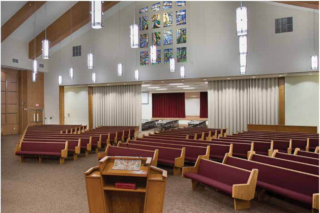
FSTC 41 test performed by Acoustic Engineer Eugene OR. ASTM designation E336-90