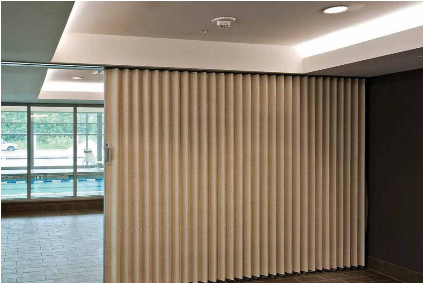
STC 41 test performed by Riverbank Acoustical Laboratories, Geneva, IL ASTM designation E90-86T