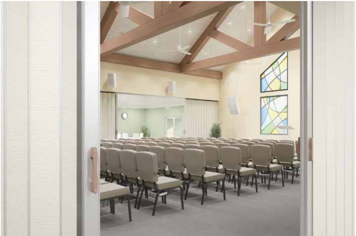
STC 21 test performed by Bruck, Richards & Chaudiere, Inc. ASTM designation E336-77