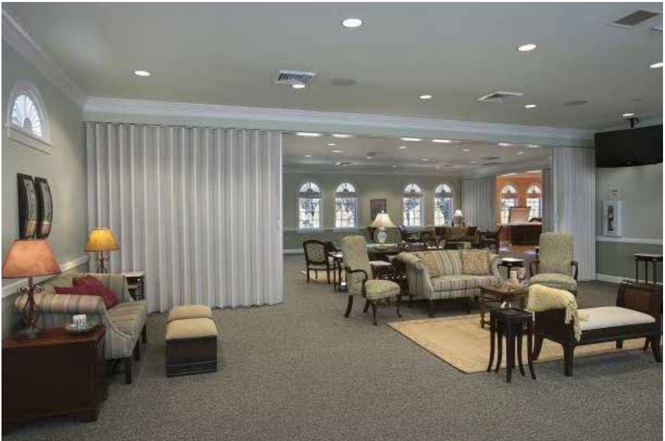
FSTC 41 test performed by Acoustic Engineer Eugene OR. ASTM designation E336-90